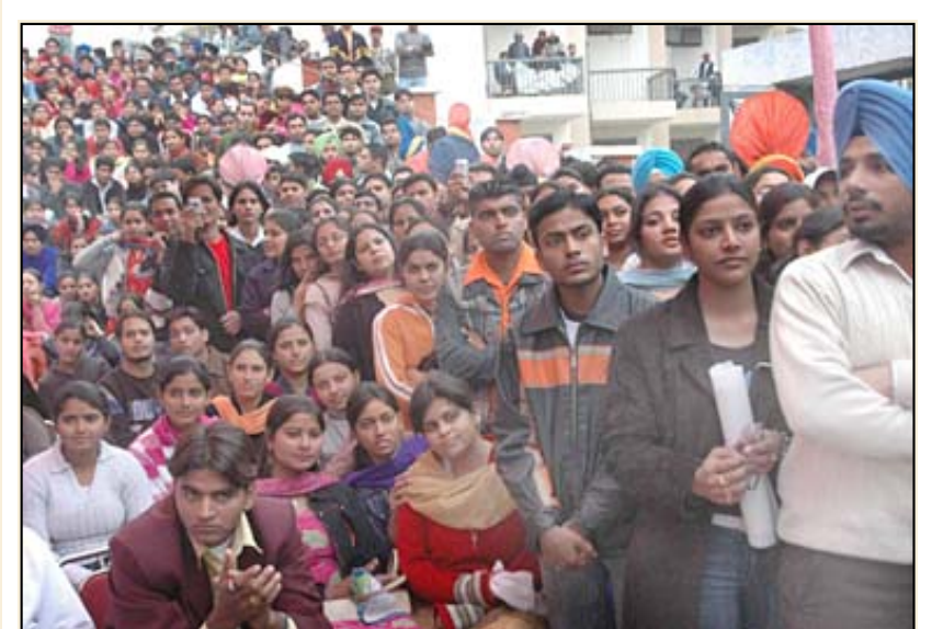
Students throng the open air theatre in Lyallpur Khalsa College to watch the cultural meet-Galaxy 2006- in Jalandhar on Sunday. The event was organised by the college's Commerce Department.

It is a revelation that is baffling the district police more and more everyday. Investigations into the murder cases reported recently from the area have revealed that majority of these had roots in women having extramarital affairs and some of them wanting to get rid of their husbands.