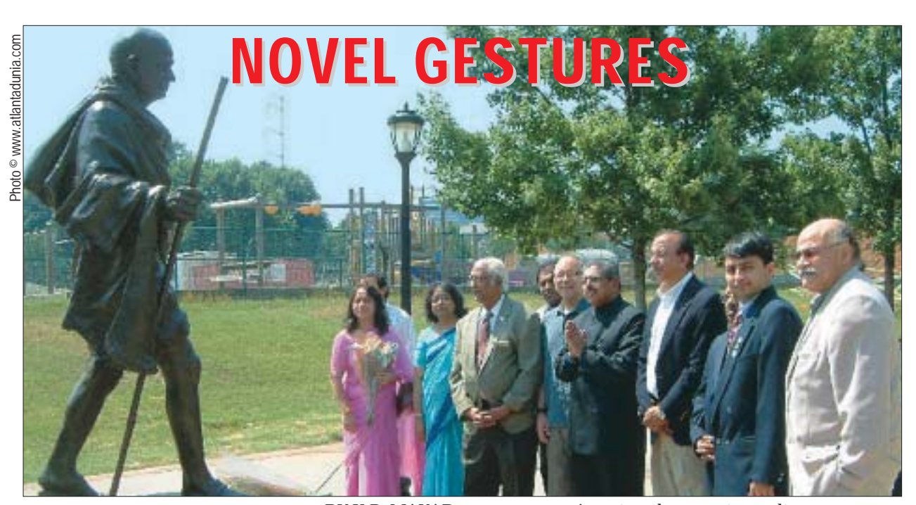
BY K.P. NAYAR

"I believe I can do my little bit in this endeavour," he investment, status of citizenship in view of the Indian said.