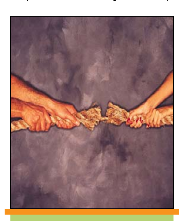
"Once a family has been tortured using the 498a weapon, the chances of reconciliation between the husband and wife is nil"

Once a family has been tortured using the 498a weapon, the